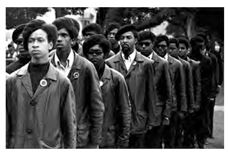
FBI Chief J. Edgar Hoover vilified the Black Panthers as "the greatest threat to the internal security of the United States."

This October 2006 marked the 40th anniversary of the founding of the Black Panther Party in Oakland, California. The legacy of the Panthers made the founding of Black Student Union possible and the creation of the first Black Studies programs. It also gave us the militancy and understanding that, "they can jail us but you can't jail our spirit"! But the fact that so many of our courageous were assassinated, incarcerated and tortured by U.S. sponsored terrorism remains our biggest defeat of the decade of the 1960's.