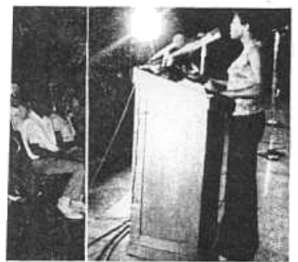
ho came to show their support for she took to insure women's right

"I went to a conference the other day in Sacramento (the California Black Political Education Conference). They had all kinds of big people there who have the power to do something. But half of them aren't doing anything. They're just sitting there. We need Black people who, out of humility, do what is best for Black people because Black people know what is best for our people. When we let the White man stand behind us and dictate over our shoulders about what we should do, then we don't need that position at all.