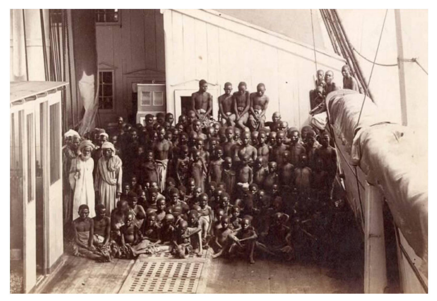
The Indian Ocean Slave trade evolved around the Indian Ocean basin. Slaves were taken from mainland East Africa and sold in markets in the Arabian Peninsula and the Persian Gulf. In contrast to the trans-Atlantic Slave Trade, the

Indian Ocean Slave Trade was much older dating back from at least the second century C.E. until the early twentieth century. For example, the oldest written document from the East Africa Coast, the Periplus of the Erythraean Sea, describes a small trade in slaves around the second century C.E. Notice the physical features of the Arabs.