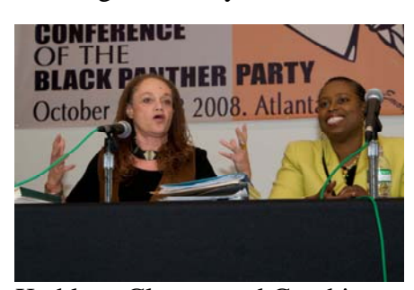
Kathleen Cleaver and Cynthia McKinney

A panel discussion examining the devastating effect of the government's counter-intelligence (COINTELPRO) program on the Black Panther Party and other Black Liberation organizations was the most popular event of the day with over 200 persons in attendance-- It was standing room only!