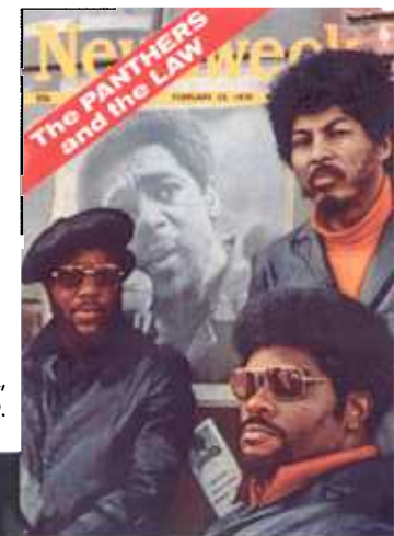
Magazine cover of Newsweek, February 23, 1970.