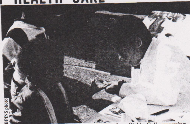
Community health volunteer conducting free Sickle Cell screening.

In addition to the screening, volunteers provide those who