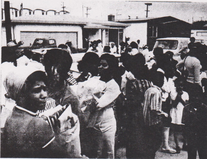
Richmond, California's Black community is benefitting from the People's Survival Programs.