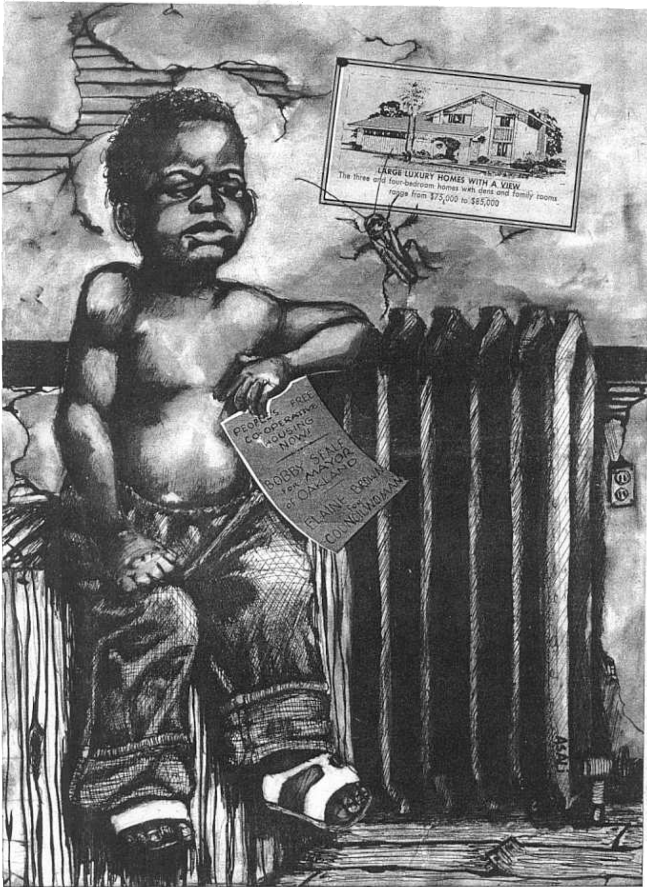
MIXED MEDIA: PENCIL, PEN, AND INK WASH

LAST NIGHT I DREAMT ALL MY FRIENDS CAME OVER TO SEE MY NEW ROOM AND PLAY IN MY YARD. BUT I SLEEP IN THE KITCHEN WITH MY SISTERS AND THERE ARE RATS IN THE LOT OUT BACK.