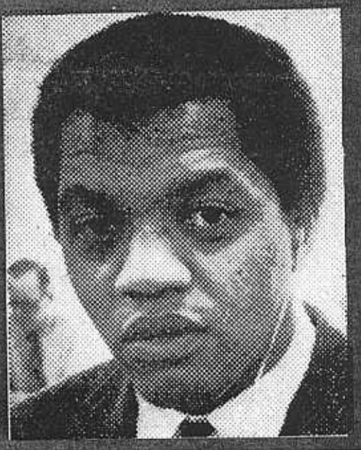
DAVID HILLIARD, CHIEF OF STAFF, BLACK PANTHER PARTY