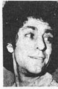
ABBIE HOFFMAN, 32.