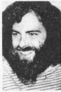
JERRY RUBIN, 31.