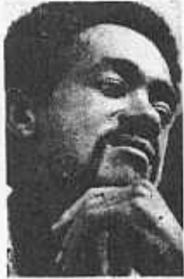
BOBBY SEALE, 37.