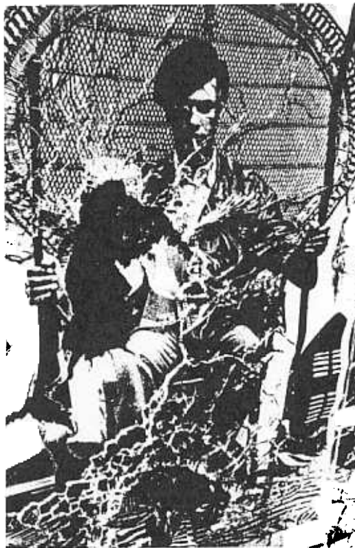
DRUNKEN, RACIST OAKLAND PIGS PRODUCED

The inconsistency is that two of our brothers were shot-up in a drunken and psychotic state, shot-up our National office, which was in Oakland at that time. There was (at that time) so many wit-