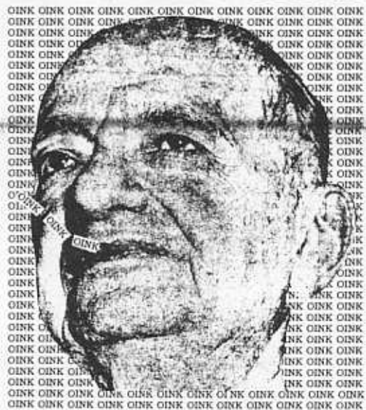
OINKING PIG JUDGE JULIUS J. HOFFMAN

Judge Adolph Julius Hoffman, 76 years old, has been named as the 'hanging judge' for the trial of the Conspiracy Eight. The 8 defendants are charged with conspiracy to incite a riot in 1968, before the democratic convention. Chairman Bobby Seale, National Chairman of the Black Panther Party, and the other 8 defendants face 10 years imprisonment and $20,000 fine if they are convicted.