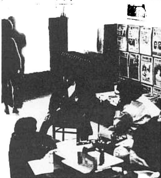
PHILLY PANTHERS DISCUSS F.B.I. - PHILLY BUREAU AND LEGAL DEFENSE