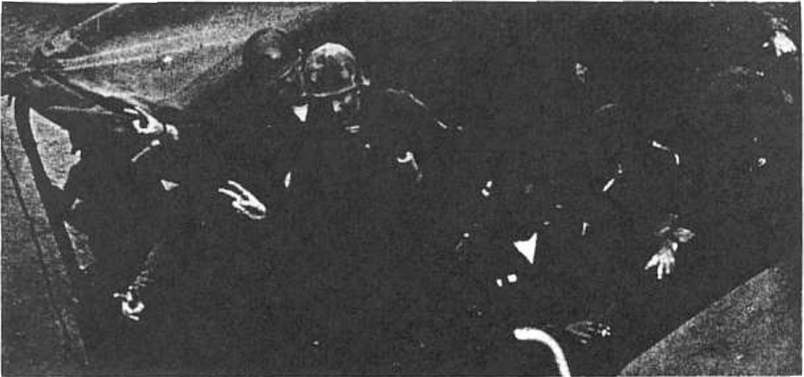
THE SPIRIT OF THE PEOPLE - OR SARCASTIC PIGS?