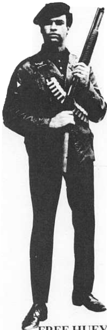
Minister of Defense, Black Panther Party