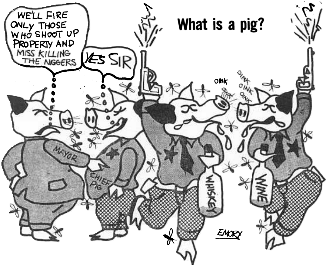
Cartoon reprinted from 1968 Issue of The Black Panther!

A LOW NATURED BEAST THAT HAS NO REGARD FOR LAW, JUSTICE, OR THE RIGHTS OF THE PEOPLE: