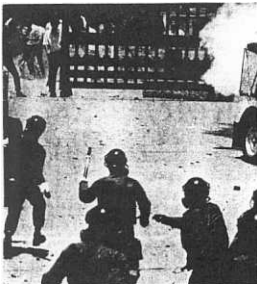
SOUTH KOREAN PIGS BATTLE PATRIOTIC STUDENTS