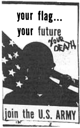
Even the people, the system once categorized as being responsible

Recently there has been an increasing amount of controversy by Afro-Americans regarding the legitimacy of Black military personnel participating in the Viet Nam conflict.