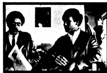
July 1967--Minister of Defense, Huey P. Newton (right) and Chairman, Bobby Seale (left), reading an early edition of B.P.P. Newspaper at the home of Eldridge Cleaver, Minister of Information B.P.P.

The Black Panther Party Black Community News Service is the alternative to the 'government ap-