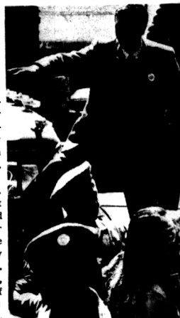
ZIONIST PIG RETREATS

Black Panther Party is not anti-semitic. In fact, we are in total