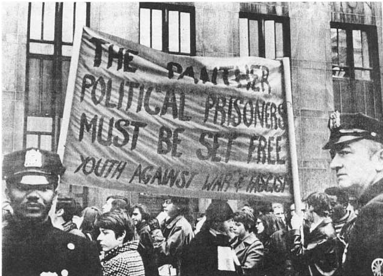
NEW YORK YOUTH ORGANIZATION DEMONSTRATES AGAINST FASCISM