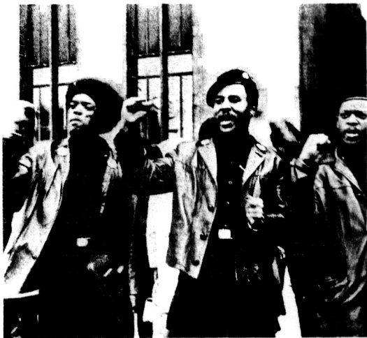
BLOOD TO THE HORSES BROW AND WOE TO THOSE WHO CANNOT SWIM