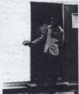
Member of community points out bullet hole.

continue to operate the Franklin Peoples Free Health Center, and with the help and cooperation of the community, we hope to expand our present facilities. This is truly socialism at work because we are moving in a collective manner to solve our collective problems with a community based and community operated program aimed at meeting the