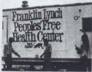
People point out some of the bullet holes.