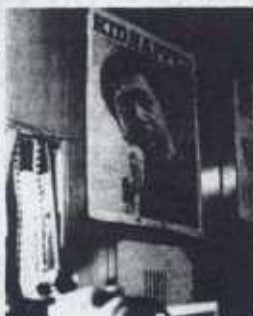
Bullet hole in laboratory

Black people can definitely relate to a Free Health Center, where we can go to have our medical needs met without going through all of the waiting, form signing and red tape that are