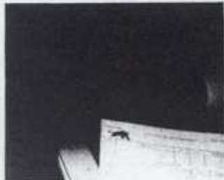
Bullet holes near receptionist desk.