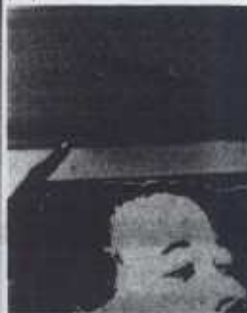
Bullet damage to inside of trailer.

During the morning hours of Sunday, July 5th, thirteen shots were fired into the trailer that houses the Franklin Lynch Peoples Free Health Center, located at Tremont and Ruggies St. Several of the bullets passed through both sides of the trailer, but two bullets were recovered, revealing that the caliber weapon used was a .38 special, the type of handgun that Boston's Finest Pork are known to carry on their hip. The damage done was minimal, and the Peoples Free Health Center was open on Sunday as usual. Many community people came to investigate and to ask questions about the shooting. The people were concerned about their Health Center, and were angry that some