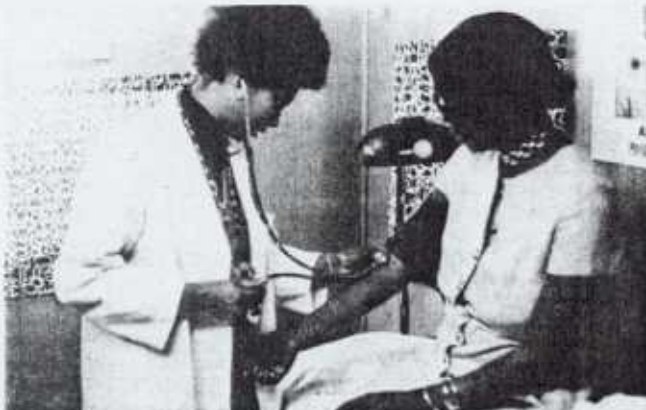
Hypertension screening at Black Panther Party's Free Health Clinic in Boston.

"Preventative health care seeks to alleviate these problems as much as possible. And, just as important as helping to lift economic burdens, preventative health care seeks mainly to insure health through attending to disorders before they become serious or dangerous disorders. Why not take care of a cut on your finger before it becomes infected and must be cut off?" □