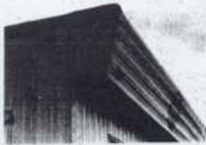
Bullet hole in patient examining area.

On May 31, 1970, the Boston Chapter of the Black Panther Party opened the Franklin Lynch Peoples Free Health Center for the purpose of serving the people of the Black community.