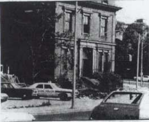
The people vamp on pig station No. 10.

It is a historical fact that when aggression and genocide is carried out on a people over a prolonged period of time, the people will inevitably strike a death blow to the oppressor through resistance which will equal the aggression. Such was the case on Saturday, June 20. The Roxbury Crossing Pig Station (Station 10) was hit with a barrage of bullets, some entering the windows of the Detectives' room and lodging in the wall, and others bouncing off the brick wall. Pig Detectives headed by Lt. Raymond Clifford, conducted an investigation which turned up nine spent cartridges on the roof of a five story brick building, several blocks from the pig station. The shells were said to have come from a British-made WW Super 303 rifle.