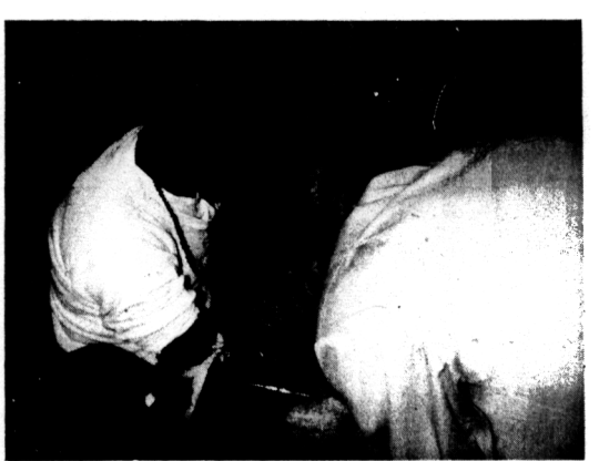
Doctor treating prisoner