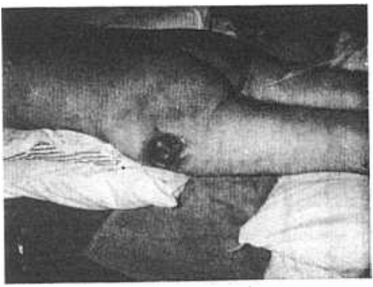
Infection caused by bed sore

cal of those conditions that exist throughout all of the oppressed communities of the world. In or-der to destroy these conditions