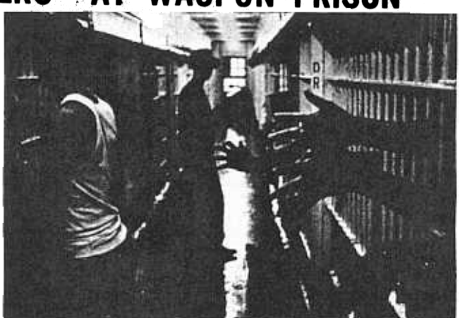
Prisoners at Waupun State in Wisconsin fear that the new underground soundproof "death chambers" will be used to harm them physically and mentally.

Besides being underground and soundproof, the new isolation cells are being equipped with sound monitoring and camera observation equipment, and each cell has its own thermostat unit which can be set for up to 100 degrees.