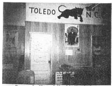
Door of office, full of bullet holes

This press conference is being called by the Toledo, N.C.C.F. to publicly denounce the victous atupon the Toledo N.C.C.F. Headquarters, as being unprovoked and highly fascist in nature. The local and national conspiracy to kill or jail members of so-called organizations has finally reached its deadly tentacles into our com-munity with hopes to steal our munity with hopes to steal our quest for freedom, but this cannot and will not be done. The incidents surrounding these