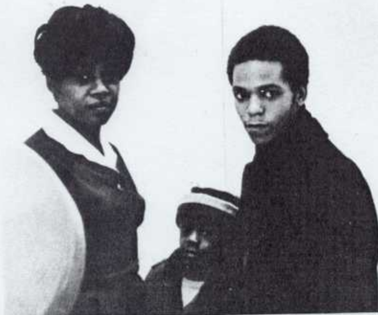
Nurse who works at Center, brother from community and "Doc".