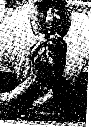
Fred Hampton, the Illinois Black Panther Party's deputy chairman, is captured in three moods during Daily Defender interview. The militant activist told why he