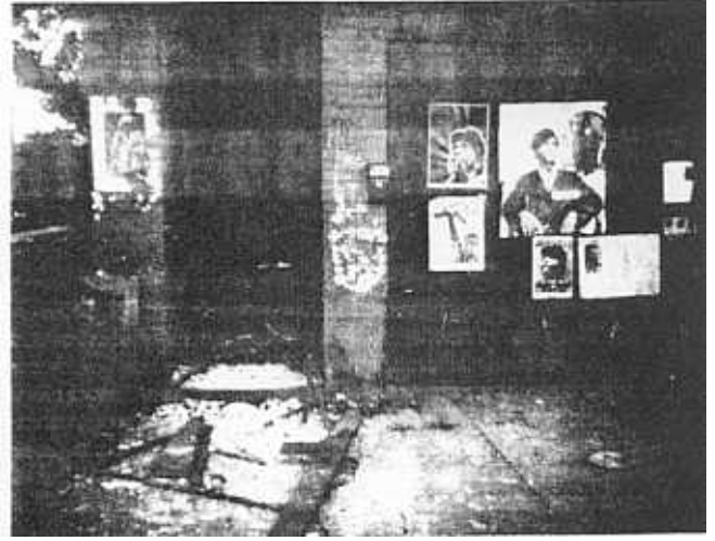
Cleveland racists close City's health clinics and then dynamite the People's Free Clinic