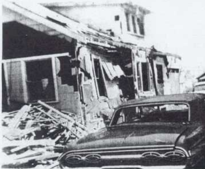
Neighbors auto destroyed with home