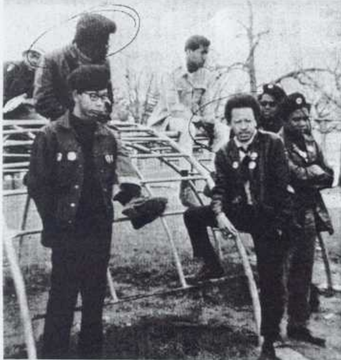
Des Moines Panthers holding planning session after blast