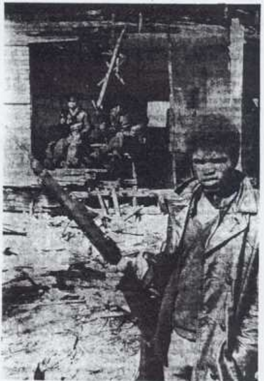
Des Moines Panthers determined to defend community

The Des Moines Peace & Freedom Club supports the just struggle of the Panther Party. We must reject the bosses' tool of racism. We will not be strong until we are united.