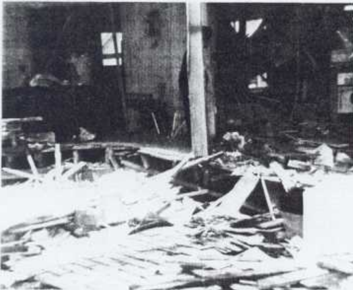
No Panthers were killed in blast