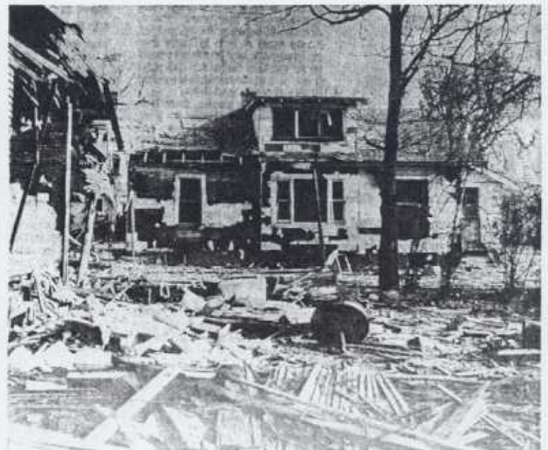
Nasty by home damaged by blast