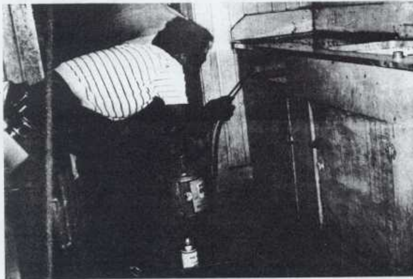
Comrade from Houston Branch rids house of disease-carrying pests.

ALL POWER TO THE PEOPLE Houston, Texas Branch Black Panther Party