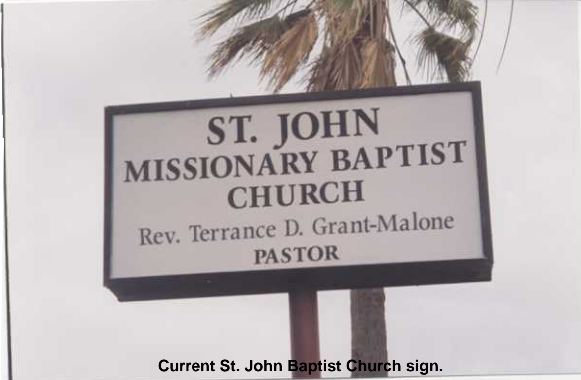
Current St. John Baptist Church sign.