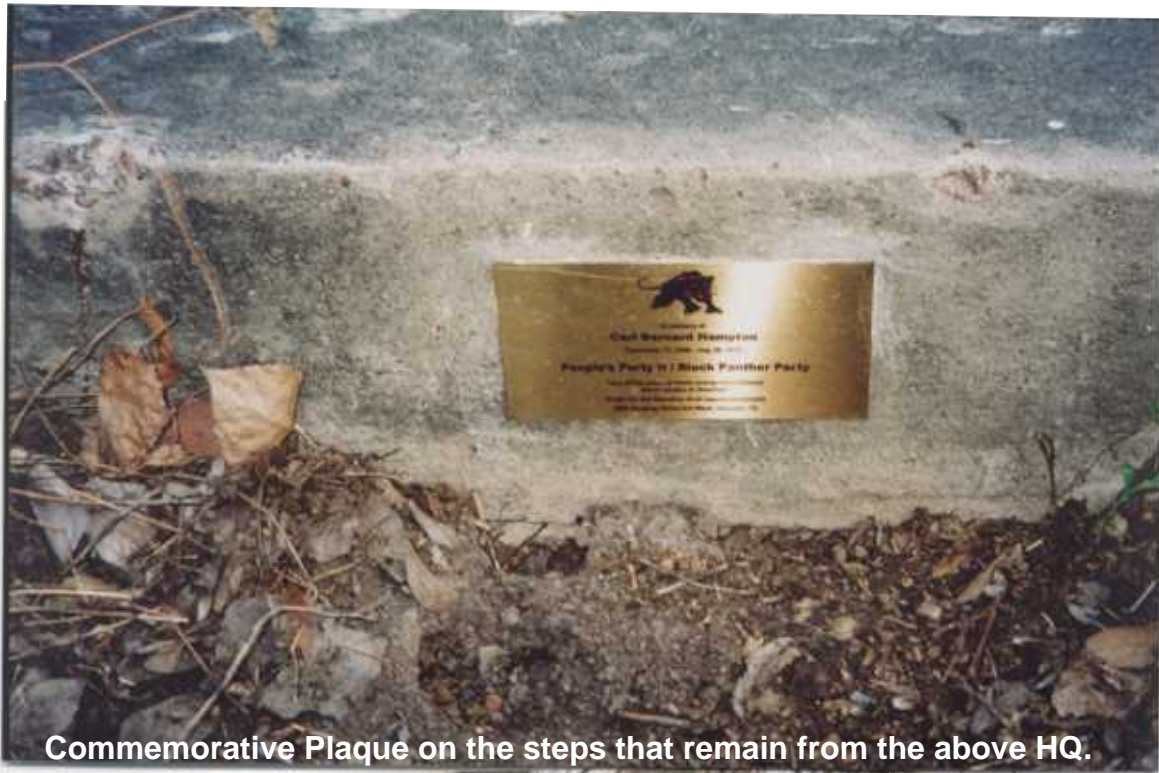
Commemorative Plaque on the steps that remain from the above HQ.