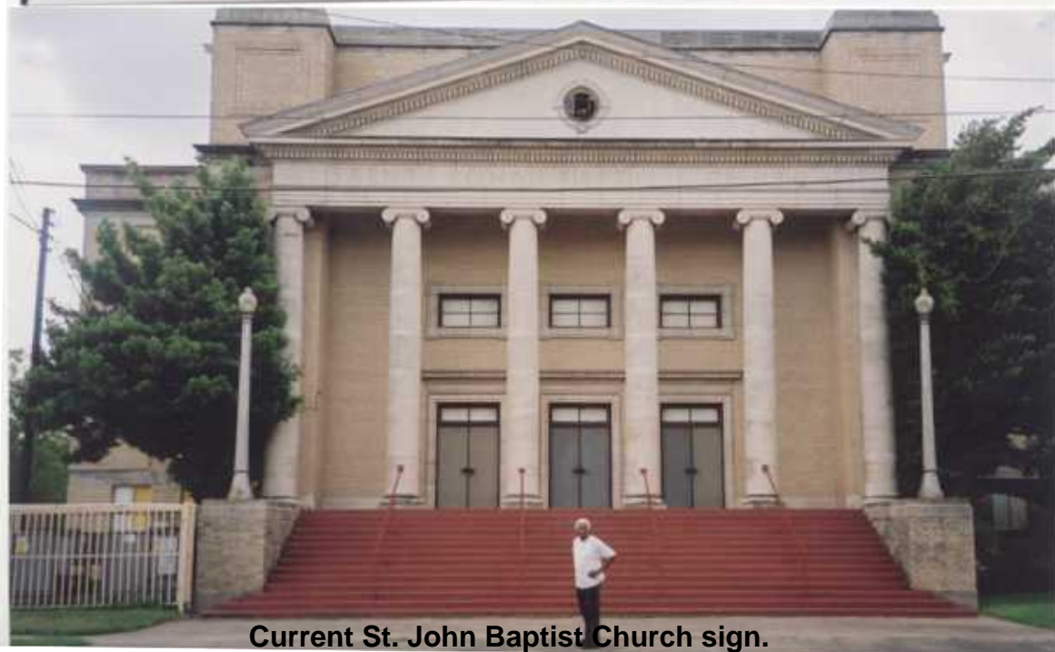
Current St. John Baptist Church sign.