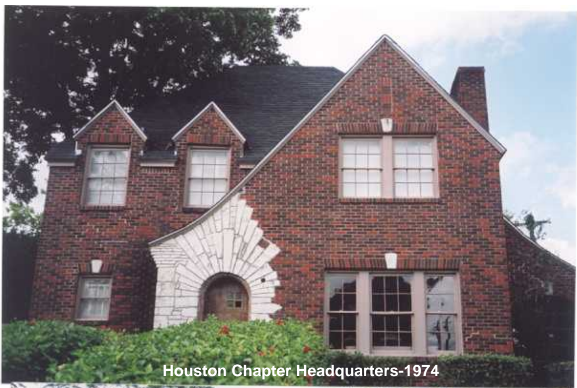
Houston Chapter Headquarters-1974