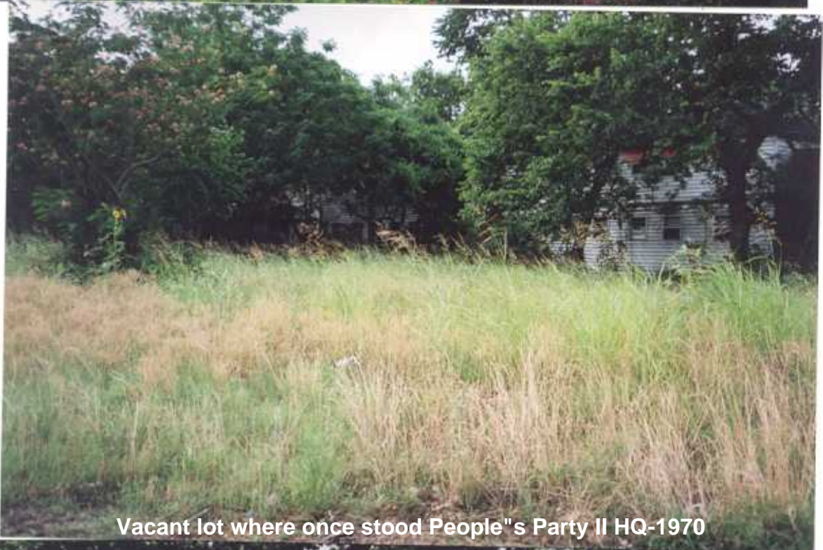
Vacant lot where once stood People's Party II HQ-1970