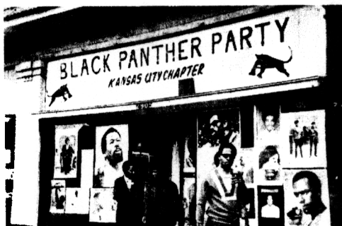
Kansas City Chapter's Office