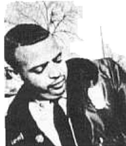
Pig De Graffenried

The people realize that the pigs make no distinction between Black Panther Party members and people of the community. The people now realize that this nation's plan to carry out acts of mass genocide has an ultimate goal of not only