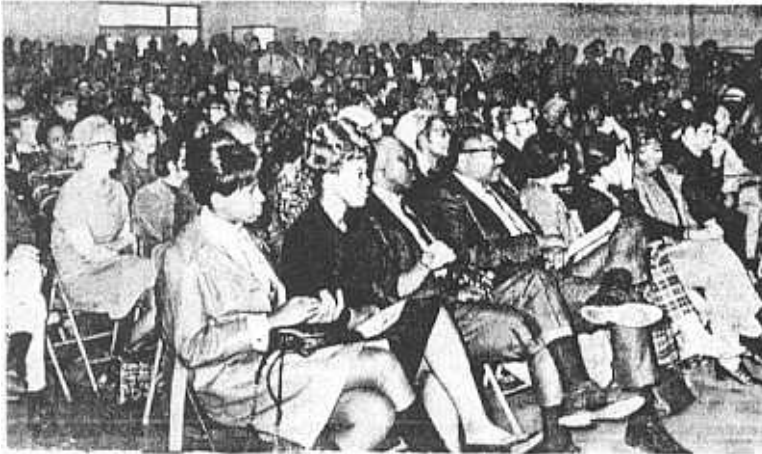
(THIS ARTICLE IS A REPRINT FROM A KANSAS CITY NEWSPAPER)