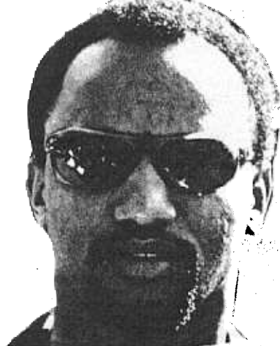
Geronimo Political Prisoner

ternationalism. The program has been introduced here in ameriKKKa for some 10 years now, and is exemplified in organizations as: that of the US organization, Le Roi Jones' Black Community Develop-