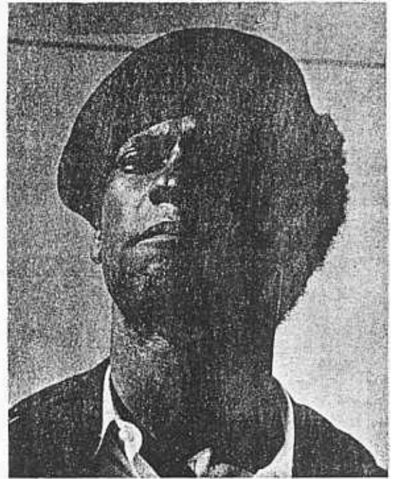
Huey P. Newton Defense Fund