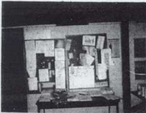
INSIDE OF JERSEY CITY PANTHER OFFICE

If Black people arming themselves from house to house, block to block, community to community all across the country, we can end this systematic genocide that is being perpetrated against Black people by the racist, fascist American government. We believe that Black people should exercise their constitutional rights. It is entirely within the law to get a gun for self-defense. Huey P. Newton, our Minister of Defense, says: