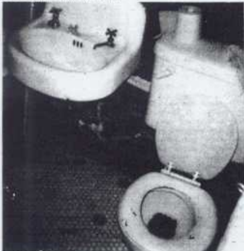
One of many bathrooms with rat holes under sinks. (Rats paradise).

Further investigation showed that the lowest rent being paid was $85 and the highest $110. We say that under present conditions the rent isn't worth $20.