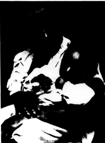
WE WANT AN IMMEDIATE END TO THE MURDER OF BLACK PEOPLE

oppressor has food, the children of our communities will eat! We will see to that.