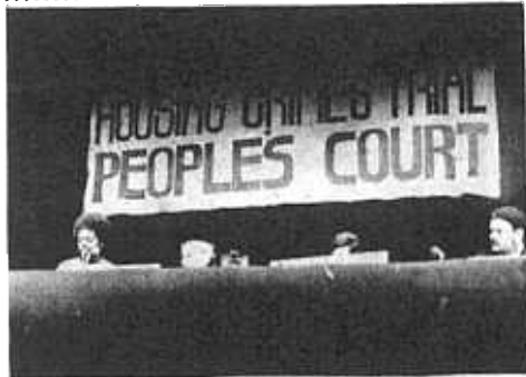
Judges speaking at the housing trial.

DEATH TO THE FASCIST PIGS! HOOT TO KILL!