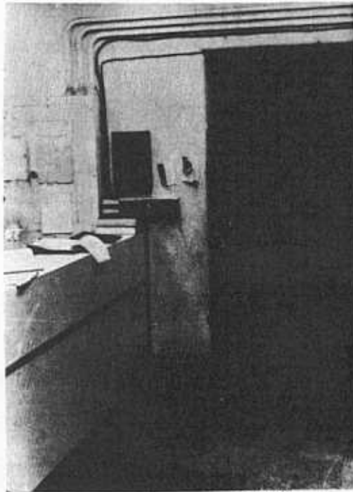
UNSANITARY WAITING ROOM AT LINCOLN

The Black Panther Party, knowing this offers a solution, We