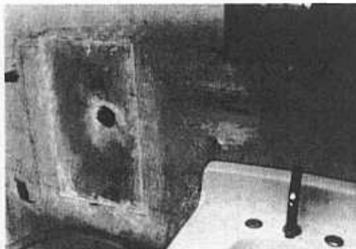
DEADLY LEAD POISONED WASHROOM WALLS

The people must no longer tolerate acts of attempted murder