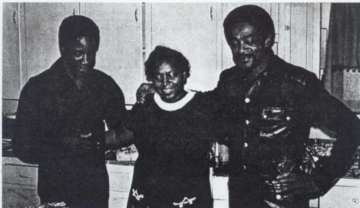
"We have to get down into the community."