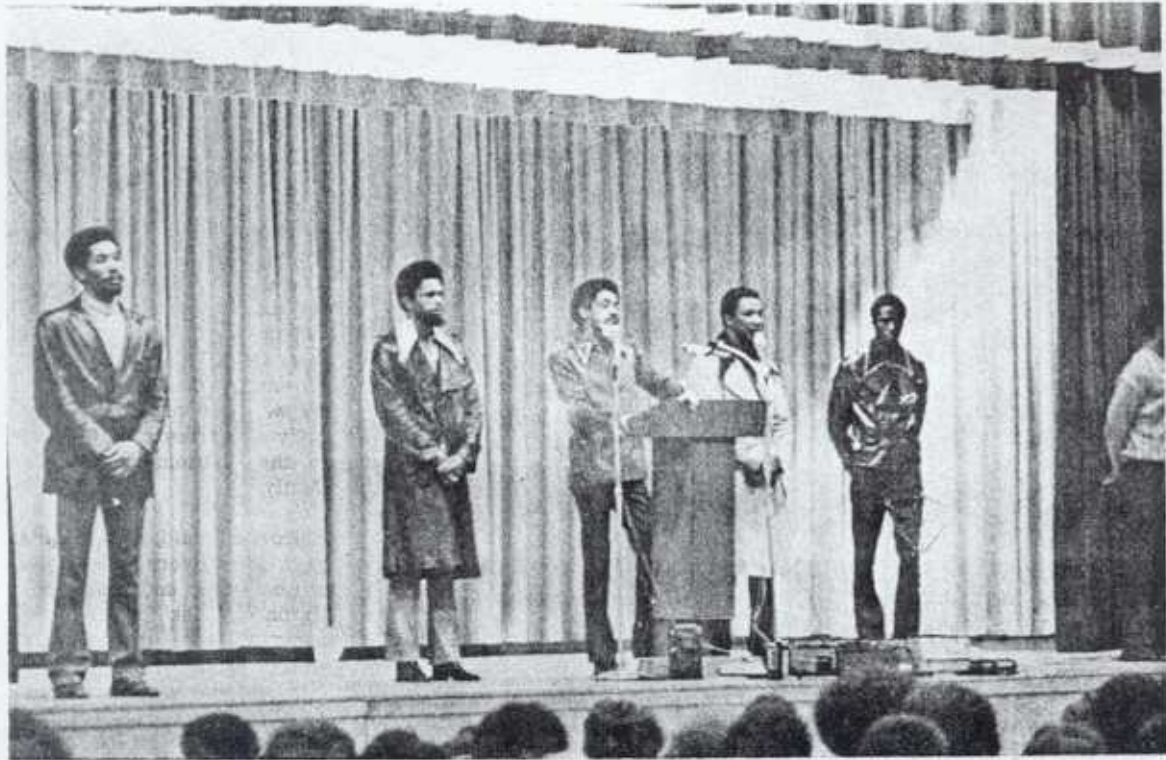
The Black Panther Party started with a program, even before we picked up the gun."