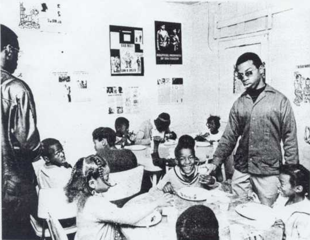
N. C. Branch of the National Committee to Combat Fascism Feeds Our Children.

The Black Panther Party, for simply trying to meet the needs of the poor oppressed people. And for educating the people by example