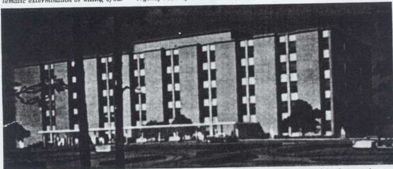
North Carolina's racist power structure came up with new schemes when Black people weren't dying fast enough.