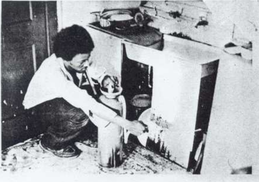
Complaints of the Black Community of rats biting babies and wholesale roaches spurred the creation of the People's Free Pest Control Program.

WINSTON-SALEM BRANCH OF THE BLACK PANTHER PARTY IMPLEMENTS FREE PEST CONTROL PROGRAM.