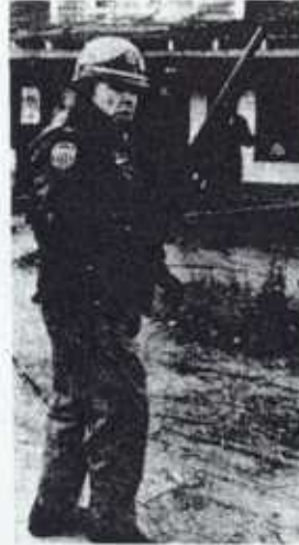
Pig with 12 gauge pump shot gun in front of Winston - Salem N.C.C.F.