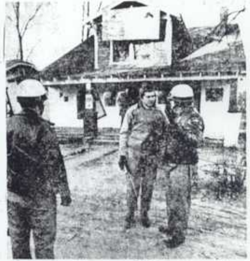
Pigs still milling around. Note supposedly bullet proof vest.

On February 10, 1971, on or about 6:00 a.m., the Police Department of High Point, North Carolina, attacked the Black Community Information Center located at 612 Hulda Street. The attack and invasion led by the police within the Black community is comparable to the fashion utilized by the armed forces of the United States Government in the invasion of communities throughout the world. (Southeast Asia, Africa etc.)