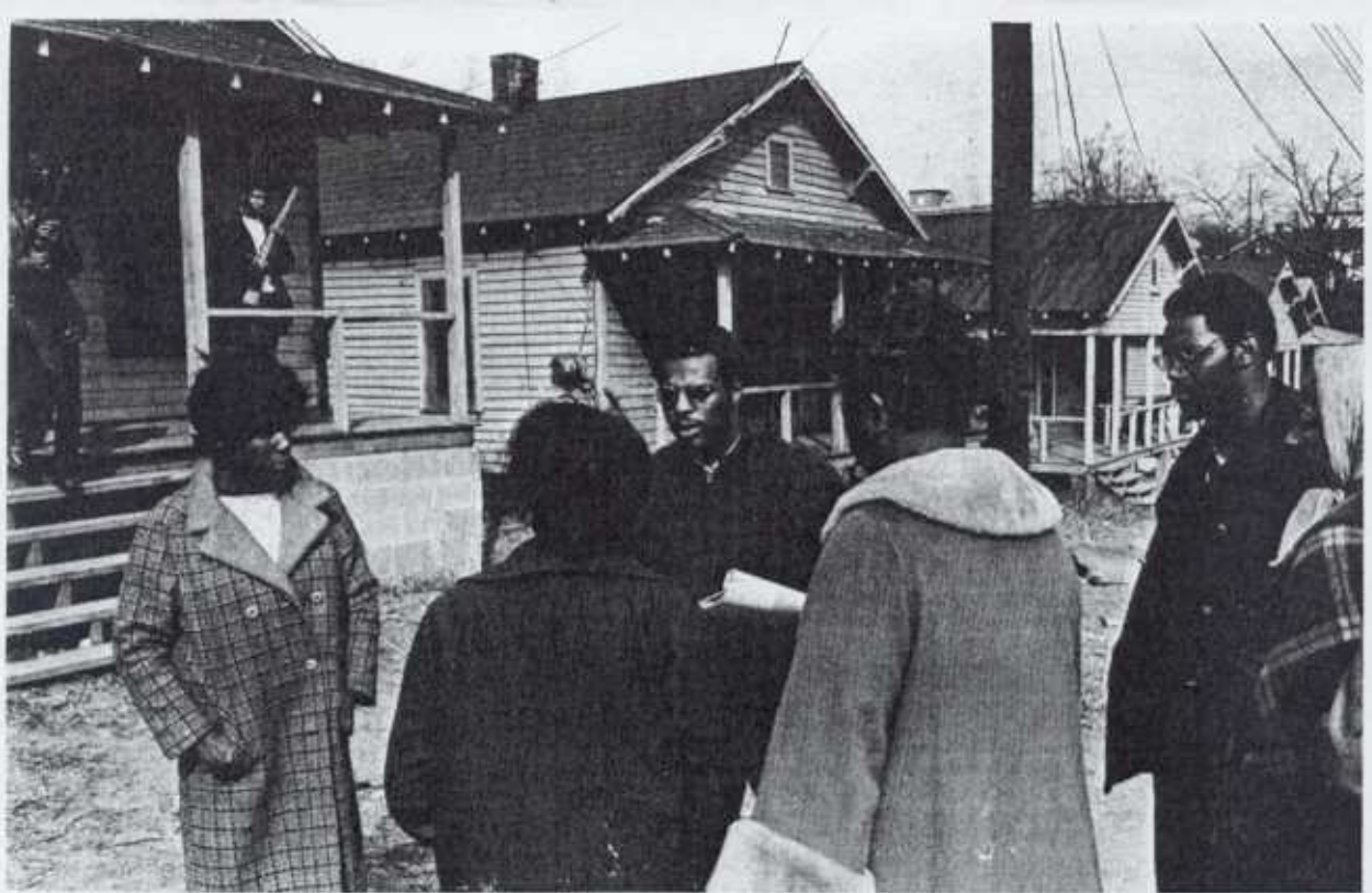
THE PEOPLE OF NORTH CAROLINA ARE READY TO DEAL WITH SLUMLORDS.