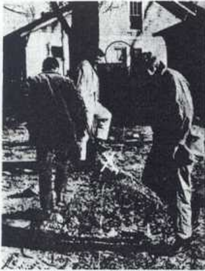
Pigs milling around after vamp of Black Community Information Center