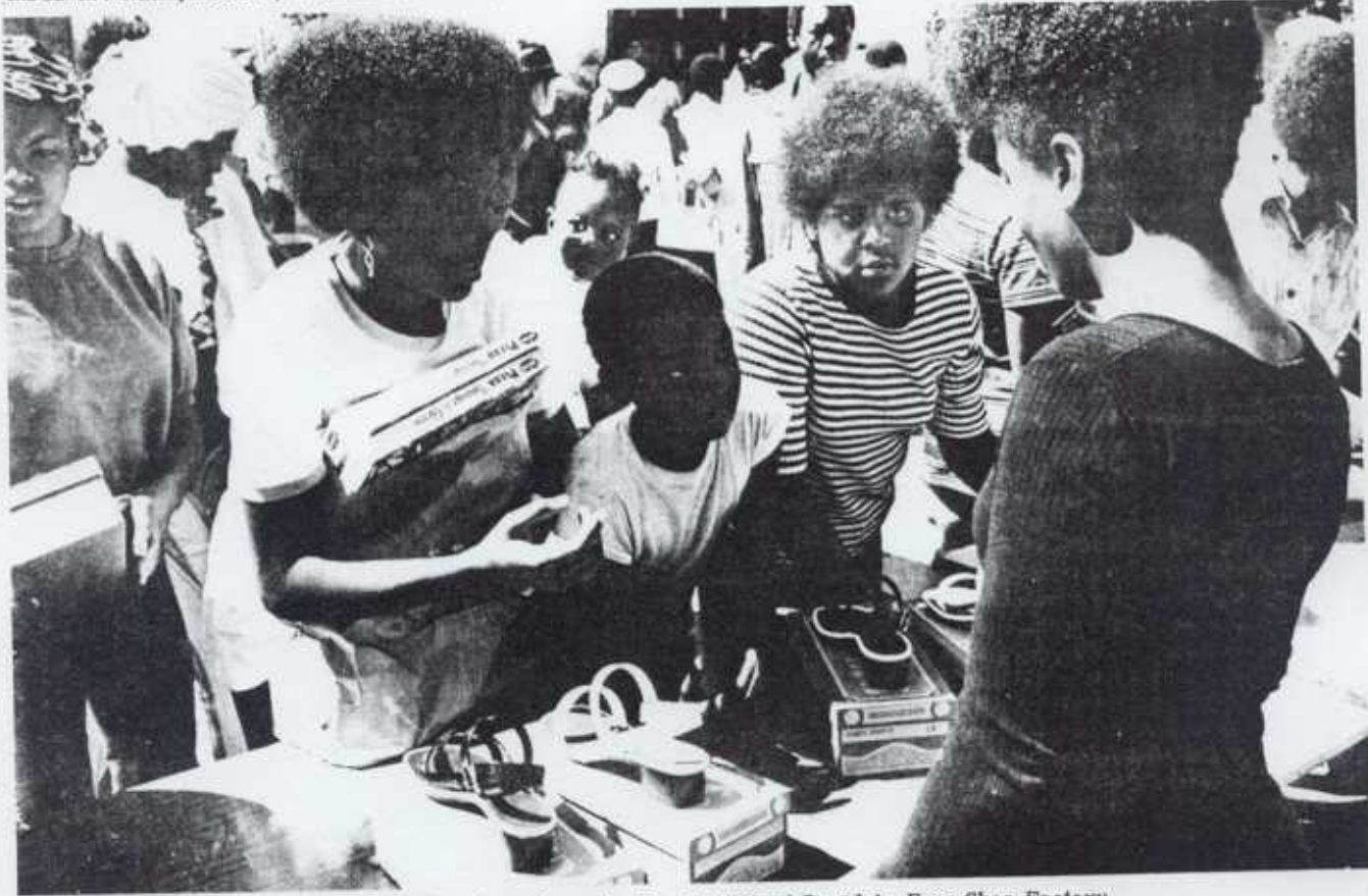
People selecting shoes from the David Hilliard People's Free Shoe Factory