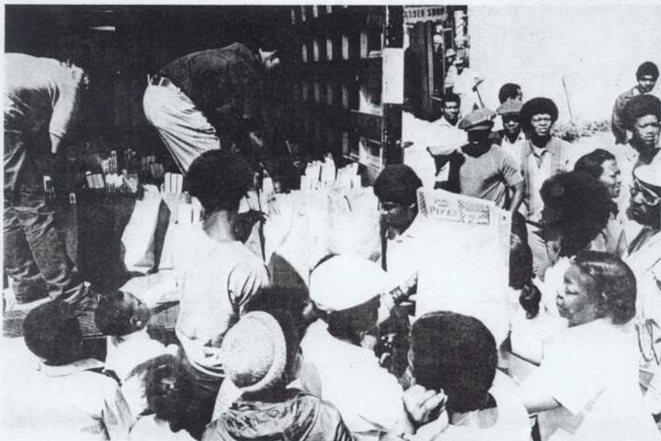
We would like to give away free food every week.