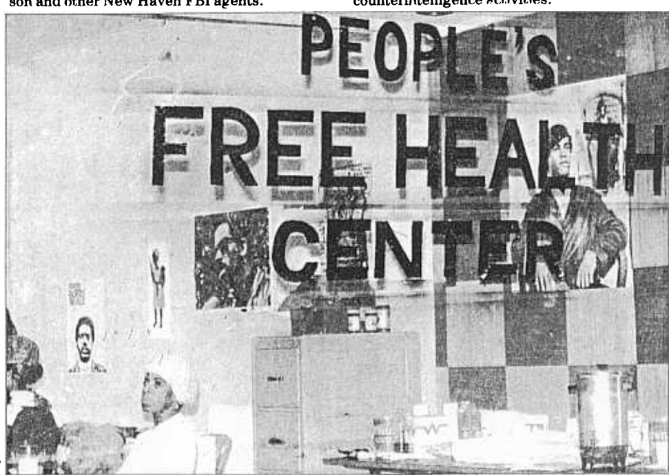
A free health clinic was one of many Survival Programs operated by the New Haven BPP Chapter.