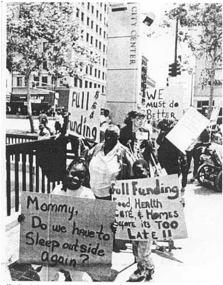
Homless demonstration in Oakland, Calif.

Food and shelter are rights, not privileges. They are the most basic needs of all human