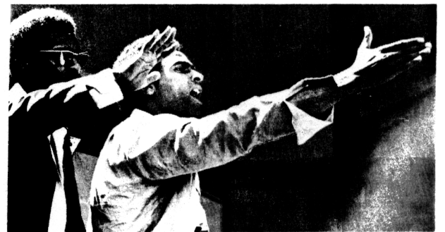
THE SPIRIT AND GENIUS OF HUEY P. NEWTON IS MOTIVATED BY THE POWER OF THE PEOPLE AND OUR STRUGGLE FOR TOTAL LIBERATION! AND THE TOTAL DESTRUCTION OF ALL OPPRESSION!