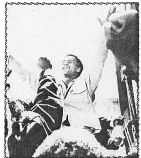
AFTER A PERIOD OF 3 YEARS BEHIND BARS, HUEY'S SPIRIT IS AS STRONG AS THAT FORCE THAT MOTIVATES IT.