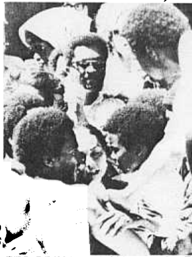
THE REVOLUTIONARY LOVE THAT HUEY HAS FOR THE PEOPLE HAS BROUGHT ABOUT THE GREAT LOVE THAT THE PEOPLE HAVE FOR HIM.