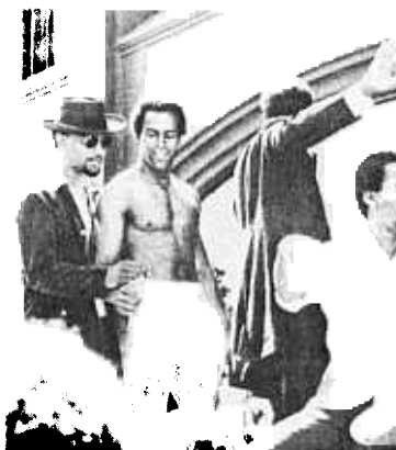
HUEY AND THE PEOPLE EXCHANGE GREETINGS MINUTES AFTER HIS RELEASE ON $50,000.00 DOLLAR BAIL.