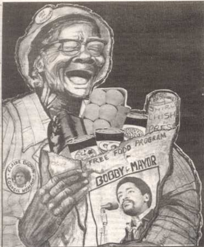
ILLUSTRATION: GABRIEL FERRAZ; ILLUSTRATION: GABRIEL FERRAZ