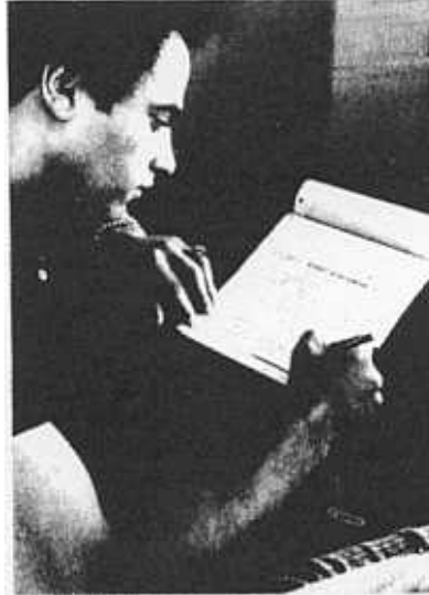
HUEY P. NEWTON, SERVANT OF THE PEOPLE, REGISTERS TO VOTE FOR SURVIVAL.

This article will try to fill in answers to some of the questions that some may have on the procedures of registering to vote and voting. Many people feel that there is no need to register and vote, but there is definitely a need. Everyone should reg-