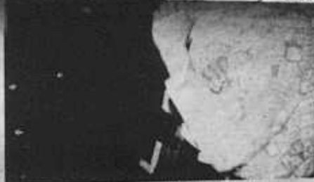
1974 Task Force arrest (see article inside)

Since September (Black Friday) 1973, the PTP with the support of many community organisations, students, workers, churches, Polynesians and Pakahans have been following Auckland's Task Force (T.F.) or P.T.G. (Police Investigative Group) Patrols to watch the aggressive tactics of the Task Force as it picks up Polynesians. P.T.G. patrol reports state that 78% of T.F. arrests seem to be Polynesians for minor offences like (continued on page 44).