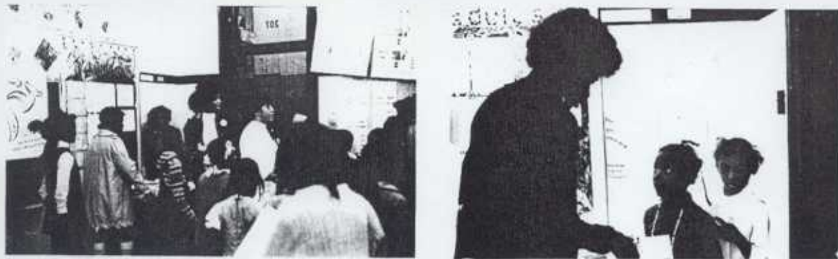
Youth At William Penn School, Awaiting Their Turns For Sickle Cell Anemia Tests