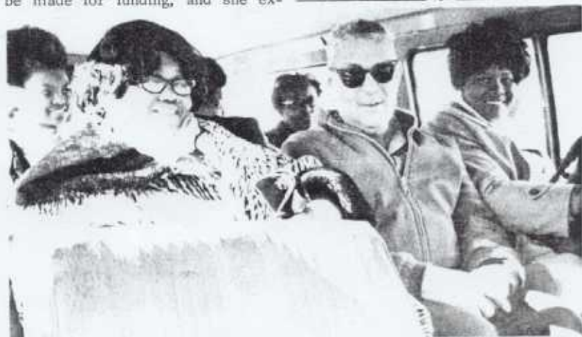
S.A.F.E. is a program which provides transportation and protection for senior citizens cashing their monthly checks.