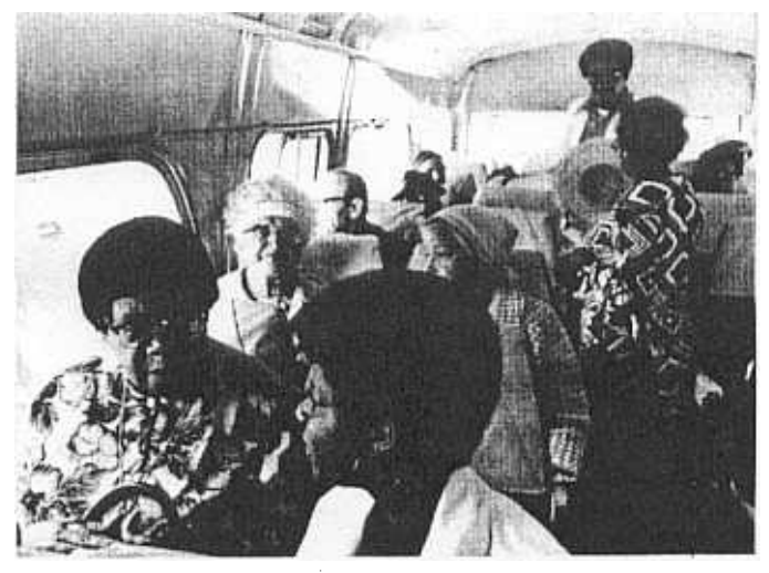
Senior citizens aboard free transportation provided for their many errands.

A majority of senior citizens receive Social Security checks and/or welfare checks. If these checks are late, or suddenly cut off, or if any other problems develop, senior citizens can call S.A.F.E.'s free Legal Aid Program for advice and information at (415) 562-5261.