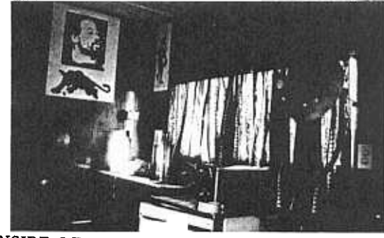
INSIDE OF PEOPLES FREE HEALTH CENTER

Services provided will be similar to those of a family doctor, including immunization, tests for diseases, emergency first aid, but most important of all, health education. High morality rates from common illnesses and diseases in Black communities and other poor communities are completely preventable and curable if people are educated to their dangers.