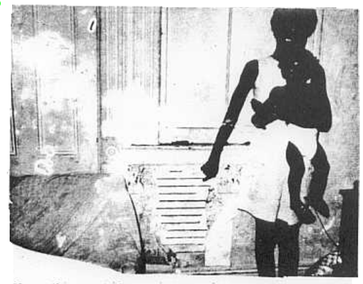
No mother wants her children to play in places like this.