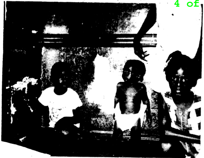
Every mother wants a decent place to live for her children.