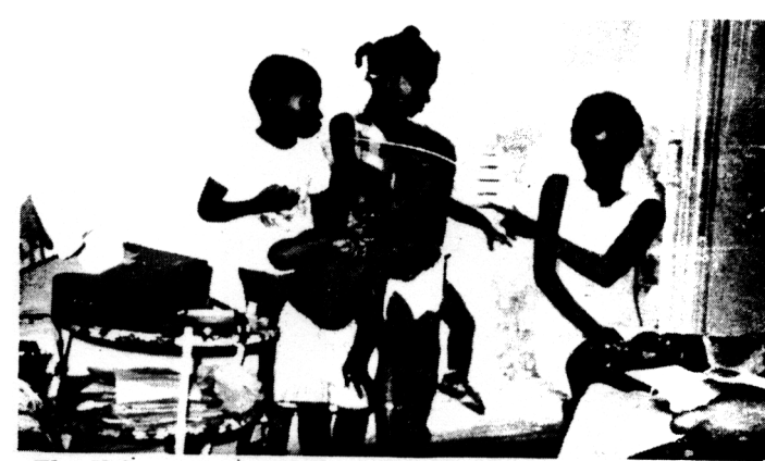
The U.S. government doesn't care about Black children.

The Black community is constantly plagued by diseases that stem directly from our unique form of oppression within America. Since our migration from the South to the East and West, we have always been forced, because we are poor, to live under the most degrading, dehumanizing conditions. Very often the buildings we live in are crumbling havens for rats, roaches and exposure to the heat and cold. Anemia and malnutrition are everyday occurrences, due to our inadequate diets. Often the buildings we are forced to live in are twenty to thirty or fifty years old. The paint used in buildings in those days was high in lead content (part of the paint base). Quite often slumlandlords today will paint over the lead-based paint, rather than scrape it off. As the thin layer of lead-free paint wears off and the old paint begins to peel, small children are often attracted to it, because of its softness and sweet taste. They usually pick this paint from walls and eat it. A child need only eat two or three flakes of paint for three months to accumulate a lethal (deadly) dose. One small chip of this old paint can contain 190 milligrams of lead. Enough chips can result in lead poisoning.