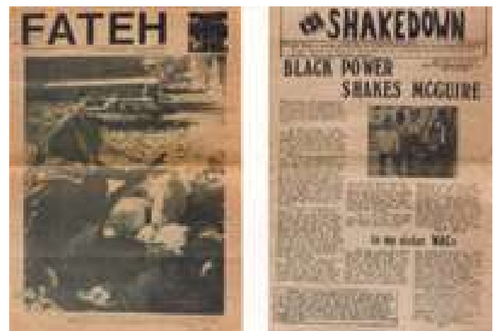
Fateh October 20, 1970 and The ShakeDown July 20 1970