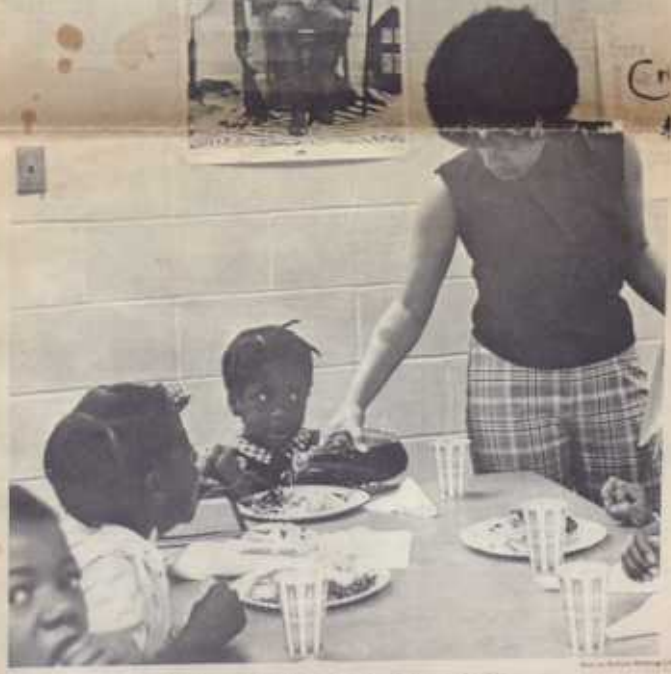
Typical activity? The Black Panther has provided programs for children.