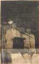
Former Brown Beret John... (Caption text is partially obscured)

Just recently, former Brown Beret... (Text continues with details about the group's activities and members.)