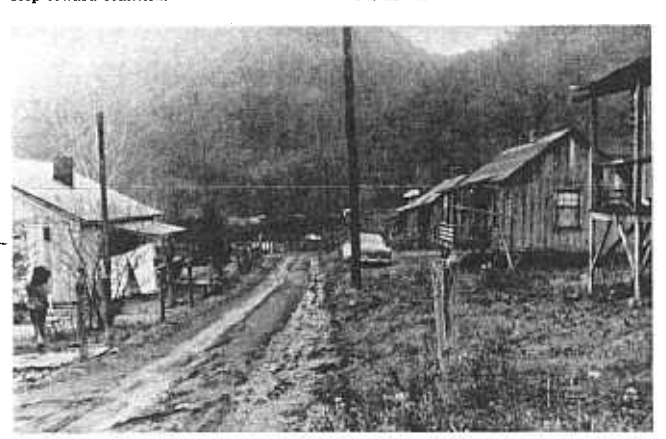
EXCEPT FOR THE MOUNTAIN in the background, these cabins where poor white people live in Appalachia could well be the cabins where poor black people live in Mississippi. Poverty is a problem that joins the interests of thousands of black and white neonle in the South.

If solutions come they will be at the local level in communities across the South—where human being works with human being and they find in life, regardless of preconceived notions and theories, that they need each other. This is where the bridges will be built if they are built at all; each time we build one we set a stone in a structure that may save the South—and perhaps the world.