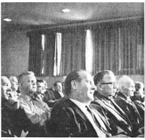
MINERS at Logan meeting listen attentively.

The doctors, and many of the miners, believe such a drive from the bottom up is the only way to force change in the coal