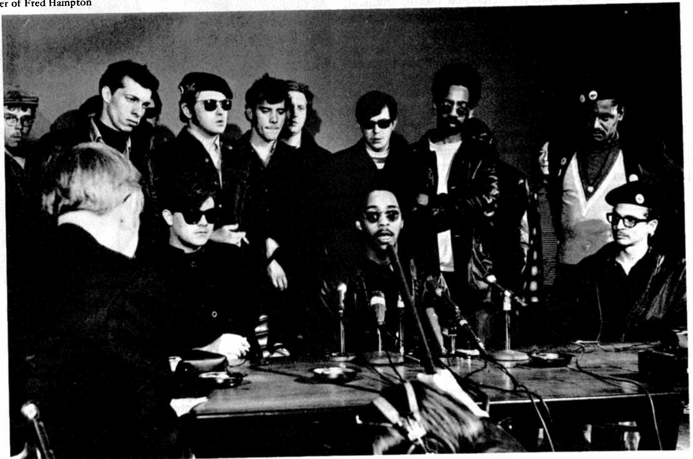
Press conference held by Black Panthers, Young Patriots, Young Lords, Black Disciples and Rising Up Angry.