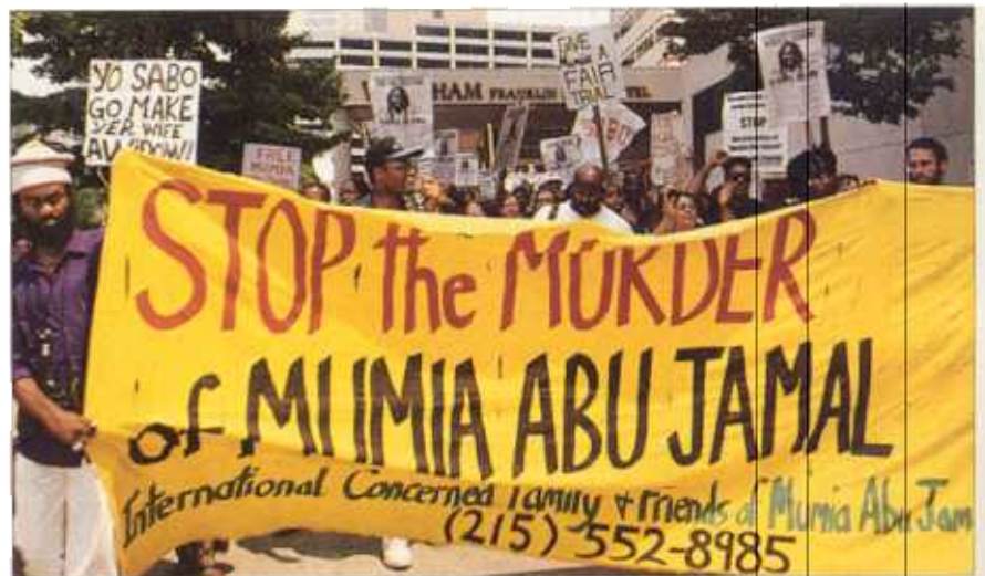
Supporters protested as Abu-Jamal, next page, was taken back and forth to court.