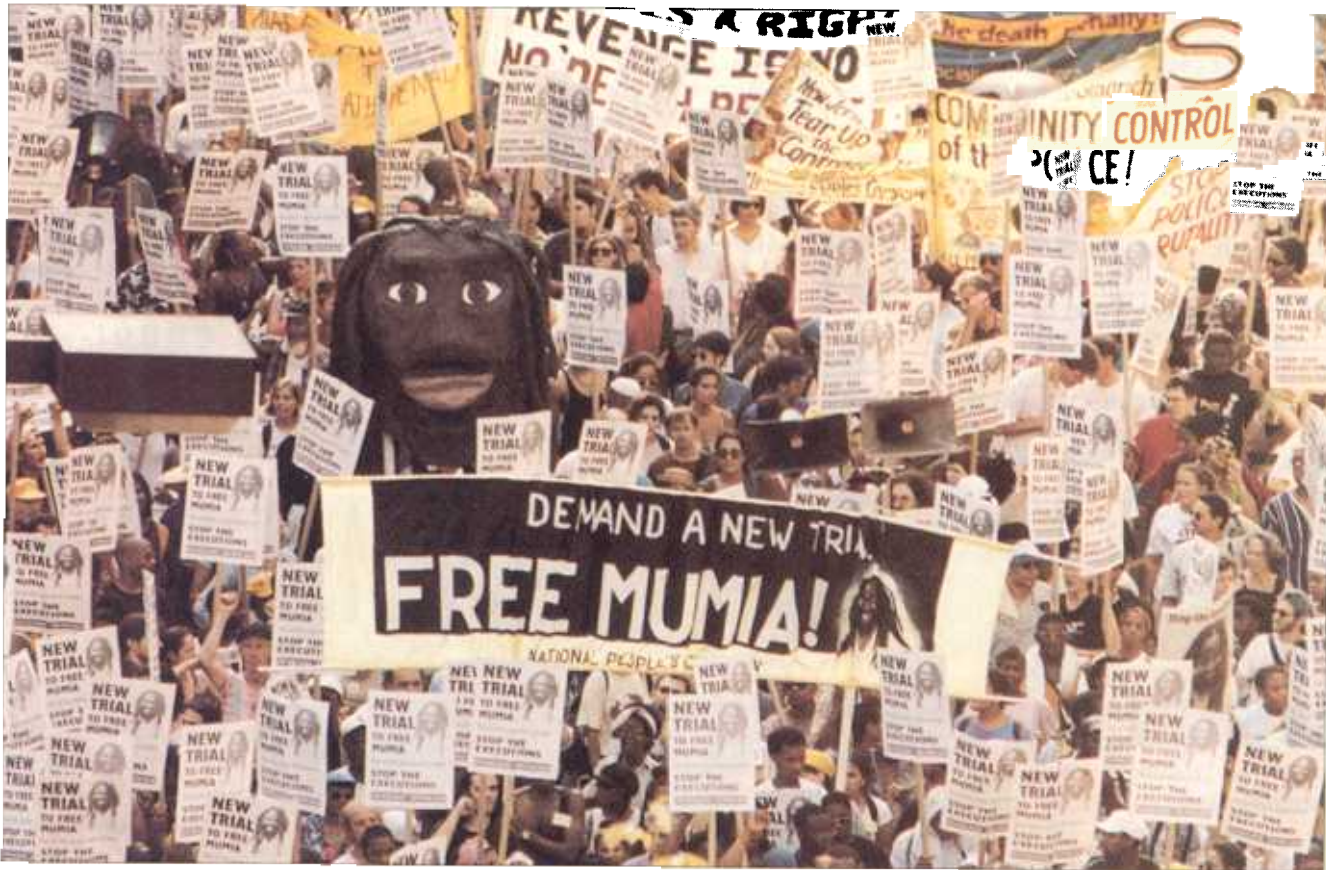
Large rallies, like this one in Philadelphia, were held across the nation, as well as in England, Italy, South Africa and Brazil.