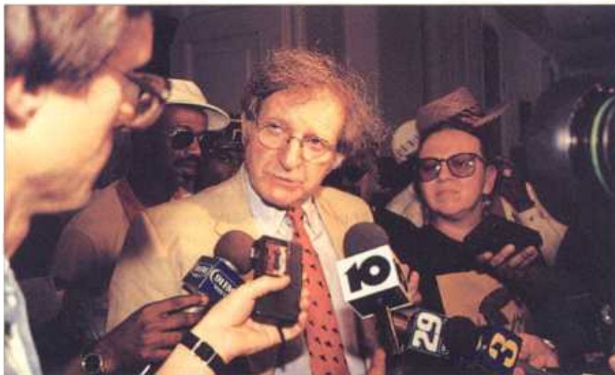
Attorney Leonard I. Weinglass, no stranger to controversy, leads the new defense team.